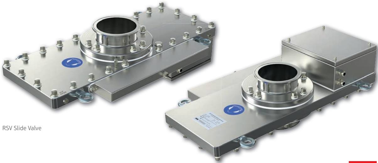
RSV Slide Valve

The REDEX® Slide is available in nominal pipe sizes from DN 50 to DN 150, the RSV slide valve in nominal pipe sizes from DN 50 to DN 500. Thanks to their practical design, both knife gate valves are suitable for all flow velocities and dust loads, they do not cause any pressure drop, and can be installed vertically, horizontally or at any angle.